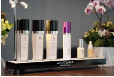
ABOVE The Les D'élégants Premium Collection & Hyaluron Éclat Superbe Collection

protect against environmental stressors and maintain healthy, radiant skin all year round," says Joachim, emphasising the brand's suitability for Malaysian skin types and lifestyles.