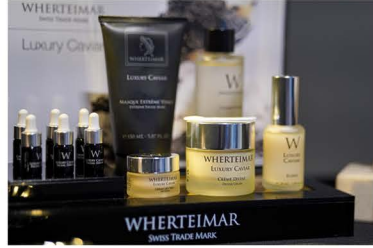
ABOVE Wherteimar's Luxury Caviar Collection

Wherteimar carries four signature collections that are each tailored to specific skin concerns. The Hyaluron Éclat Superbe range delivers intense hydration and anti-ageing benefits, while the Platinum Signature collection focuses on lifting and firming. Les D'élégants Premium (Black Rose) offers indulgent nourishment for dry or fatigued skin, and the Luxury Caviar collection provides exquisite care to improve elasticity, radiance and overall skin vitality.